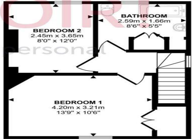
First Floor Approx 36 sq m / 389 sq ft

This floorplan is only for illustrative purposes and is not to scale. Measurements of rooms, doors, windows, and any items are approximate and no responsibility is taken for any error, omission or mis-statement. Icons of items such as bathroom suites are representations only and may not look like the real items. Made with Made Snappy 360.