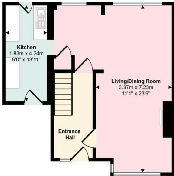
Ground Floor Approx 46 sq m / 492 sq ft

Approx Gross Internal Area 91 sq m / 982 sq ft