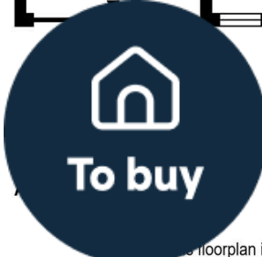
First Floor Approx 40 sq m / 427 sq ft

This floorplan is only for illustrative purposes and is not to scale. Measurements of rooms, doors, windows, and any items are approximate and no responsibility is taken for any error, omission or mis-statement. Icons of items such as bathroom suites are representations only and may not look like the real items. Made with Made Snappy 360.