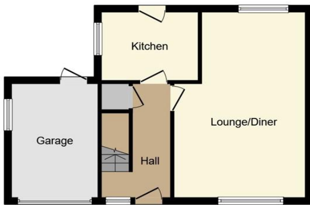
Ground Floor Floor area 42.7 m 2 (460 sq.ft.)