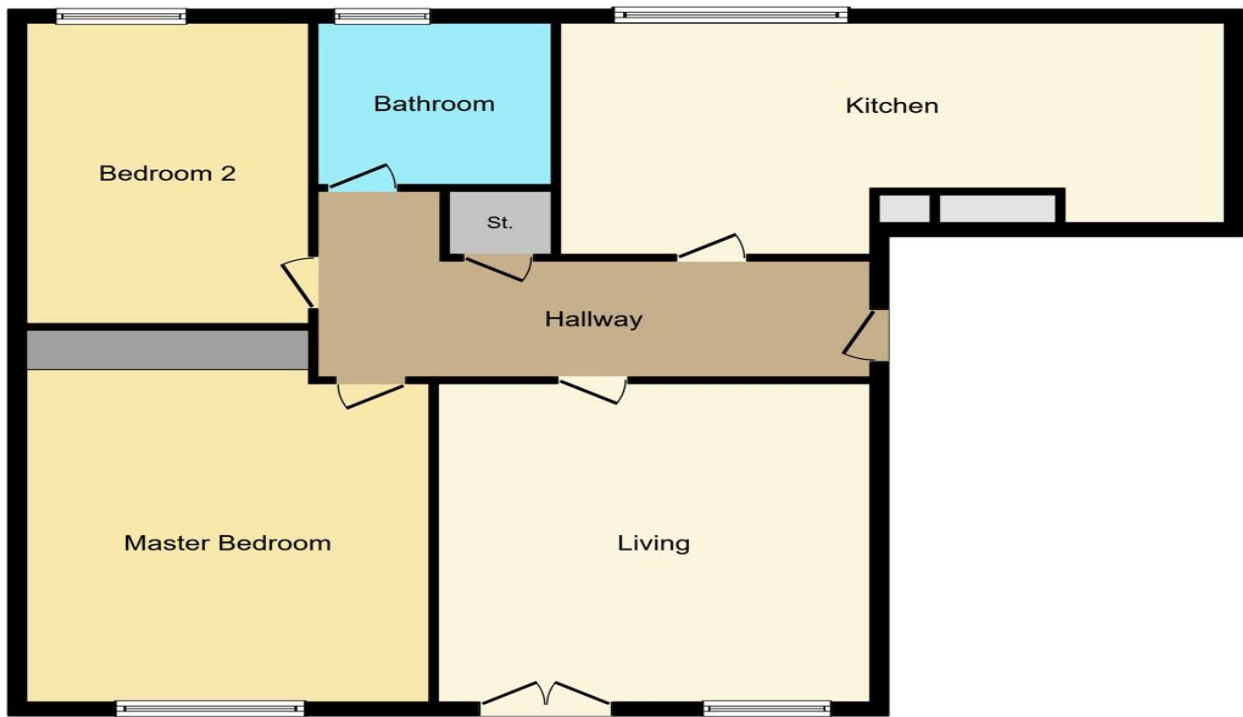
Floor area 111.0 sq. m. (1,195 sq. ft.) approx

Total floor area 111.0 sq. m. (1,195 sq. ft.) approx